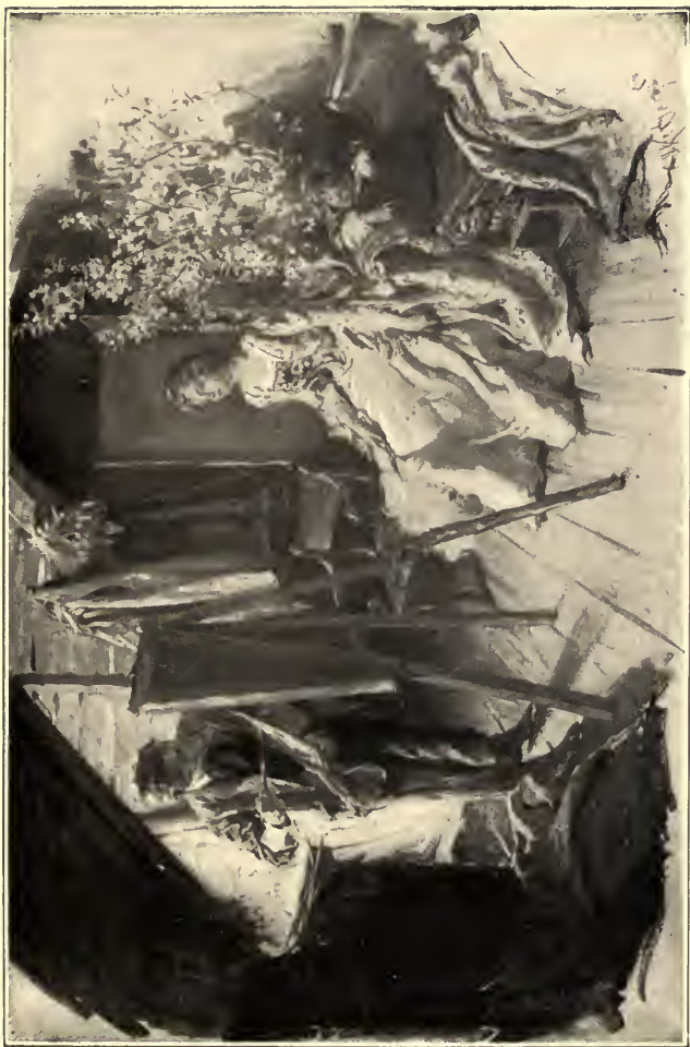
And so the picture was begun.